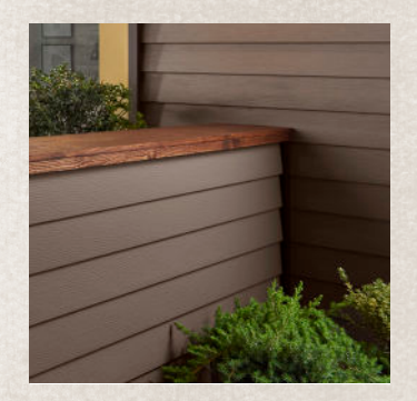
Ply Gem Steel Siding