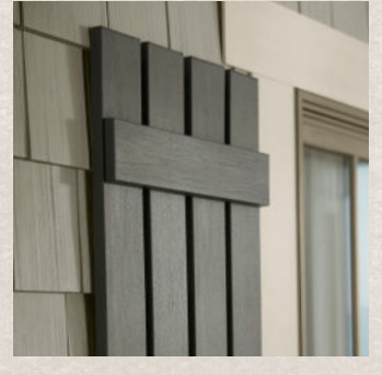
Ply Gem Shutters and Accents